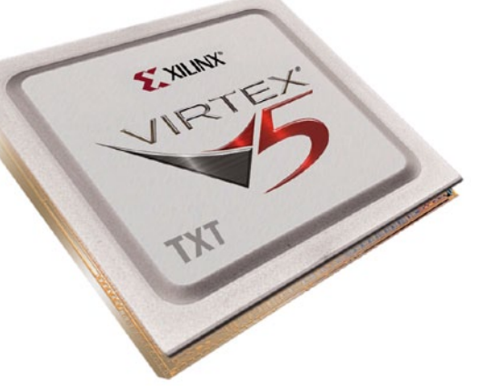
Virtex C2 AE-5 TXT FPGA from Xilinx

Now, even for a single family of product, the user has quite a few options to select from, such as ARM-based SoCs that are user-customisable. This helps reduce system power and board size while increasing system perfor-