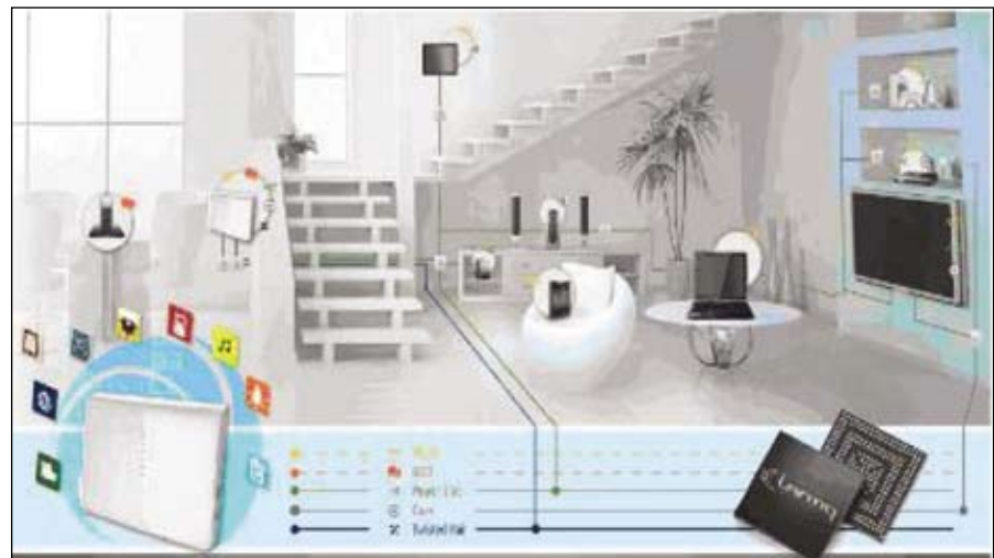
Figure 3: Typical G.hn implementation, Credit: Lantiq Holdco S.a.r.l – www.lantiq.com

Netricity PLC looks to address the need for longer range powerline networking for outside-the-home, smart grid and industrial applications. Netricity PLC will operate in low